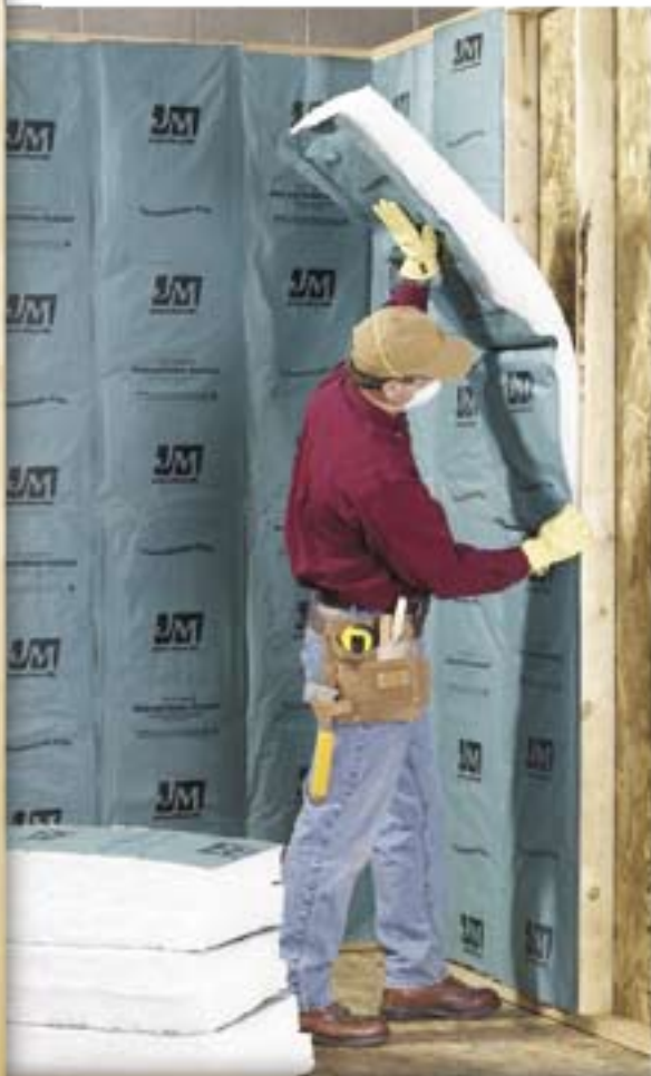
Courtesy Johns Manville

Johns Manville's line of formaldehyde-free fiberglass insulation is available in pre-cut batts to fit standard wall cavities.