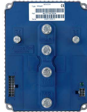
Brushed Permanent Magnet Motor Controller