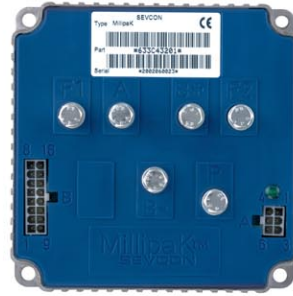
Separately Excited Motor (SEM) Controller

Speed, efficiency, flexibility. SEM offers a contactor-free solution to regenerative braking and field weakening, with improved efficiency. Complementary switching techniques provide improved speed control without added sensors.