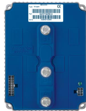
Series Pump Controller