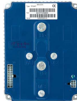
Permanent Magnet AC Controller