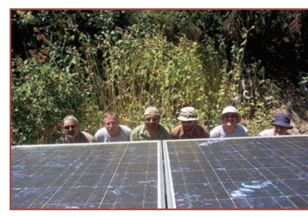
The crew of volunteer installers checks out the solar-electric awning from below.

Finishing our energy efficiency upgrades just happened to coincide with some favorable legislation that got our PV system off the "wish list" and out into the sun, generating