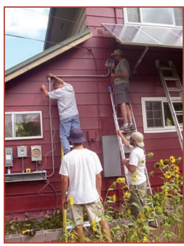
Running the DC wiring from the array to the disconnect.

Our local utility, Delta Montrose Electric Association (DMEA), offers net metering for systems up to 25 KW. Ironically, while DMEA is one of the progressive utility cooperatives in Colorado, their $20 monthly minimum utility bill policy can undermine the financial benefits of residentialscale grid-tied PV systems. The result is that even if you offset all of your electricity consumption with a solar-electric system, you will still be charged $240 each year for electricity! While this policy significantly reduces (or may even negate) the financial payback of a grid-tied PV system in their service territory, and is in direct conflict with energy efficiency and green power strategies otherwise promoted by DMEA, we refused to be deterred from accomplishing our green power goals.