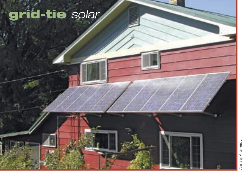
The dual-purpose solar-electric awning generates year-round electricity and, in the summertime, shades the first-floor windows.